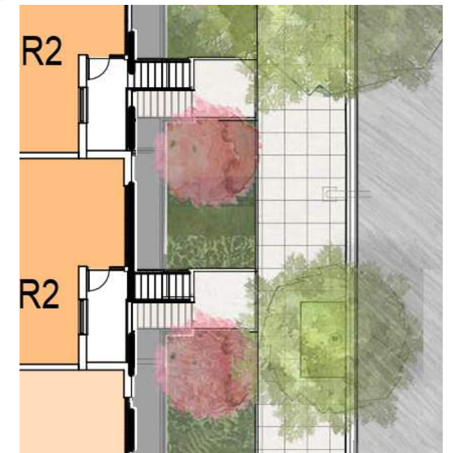
DETAILED PLAN VIEW OF M ST. UNIT ENTRIES